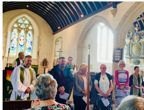
Bodmin Team Churches